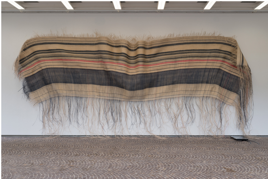
Kasia Fudakowski, Working Title: The Worry Wall , 2017 rattan, stain, steel, video; 500 x 1500 x 10 cm