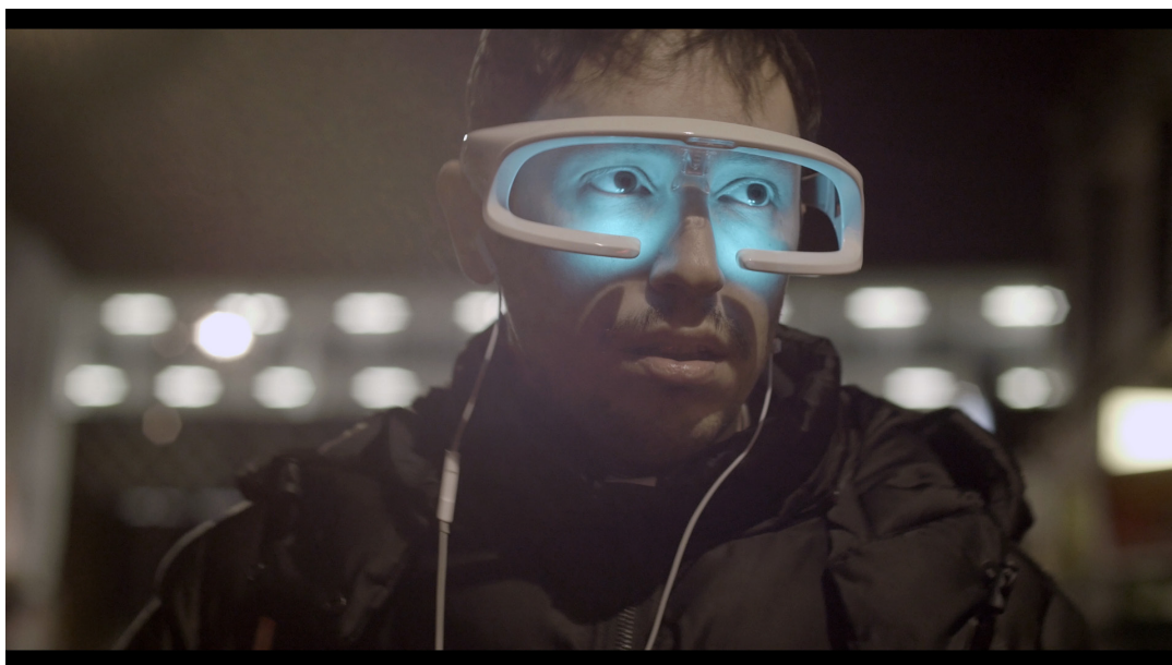
Martin Kohout, Slides (film still), 2017, Full HD video, 22'30'', copyright the artist