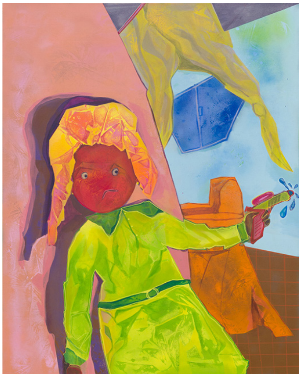
Amna Elhassan, Watergun , 2024, acrylic on canvas, 100 x 80 cm