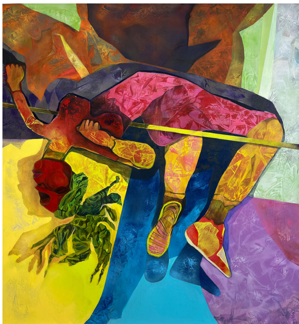
Amna Elhassan, Jump Higher , acrylic on canvas, 140 x 120 cm