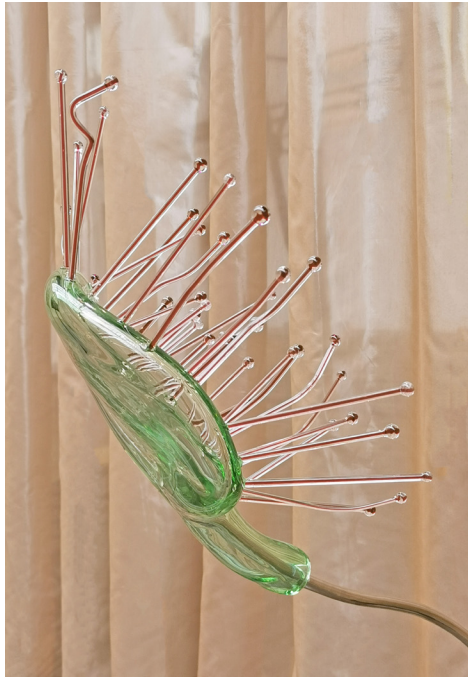
Nona Inescu, Drosera capensis , 2021 glass, chrome-plated steel approx. cm 80 x 40 (glass), cm 130 (steel), Courtesy SpazioA, Pistoia